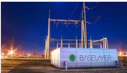
A modular data center connected to the power grid at a utility substation

Although vendor lists have been published, disaster recovery is not a product, it's a service, even though several large hardware vendors have developed mobile/modular offerings that can be installed and made operational in very short time. [35]