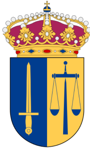
Scales and sword in the arms of a Swedish court of law