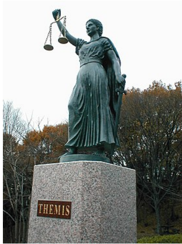
Themis, Chuo University, Tama-shi, Japan