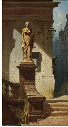
Justitia (Spitzweg), Carl Spitzweg, 1857