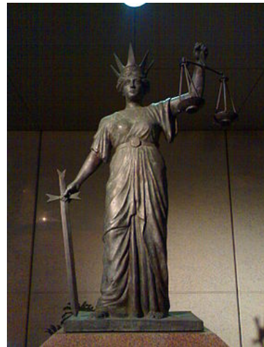
Themis, outside the Supreme Court of Queensland, Brisbane, Queensland, Australia