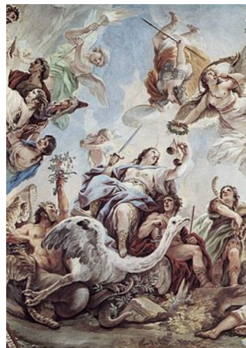
Luca Giordano, Palazzo Medici Riccardi in Florence, 1684–1686