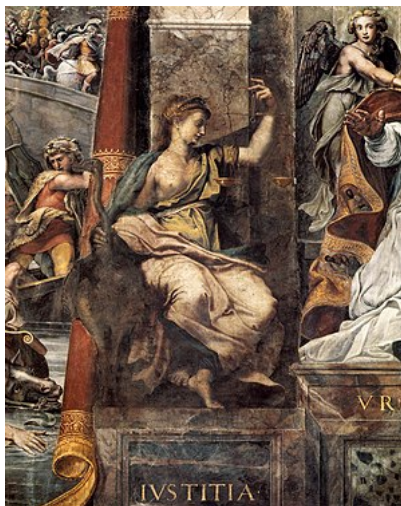
Fresco in the Sala di Costantino, Raphael, c. 1520