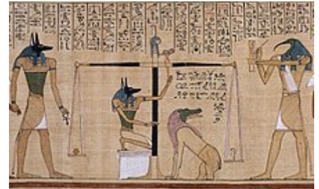
The Ancient Egyptian Book of the Dead depicts a scene in which a deceased person's heart is weighed against the feather of truth .

The personification of justice balancing the scales dates back to the goddess Maat , [4] and later Isis , of ancient Egypt . The Hellenic deities Themis and Dike were later goddesses of justice. Themis was the embodiment of divine order, law, and custom, in her aspect as the personification of the divine rightness of law.