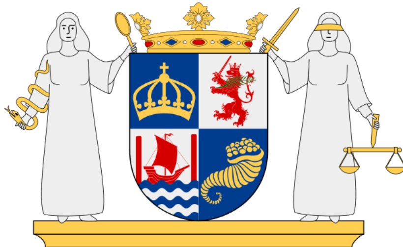
Prudentia and Justitia as supporters in the armorial achievement of Landskrona