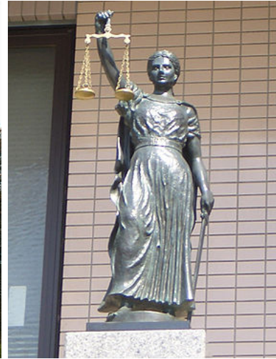
Themis, Chuo University Suginami high school, Suginami-ku, Japan