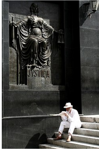
Justiça , high-relief in front of Justice Palace, Campinas, Brazil