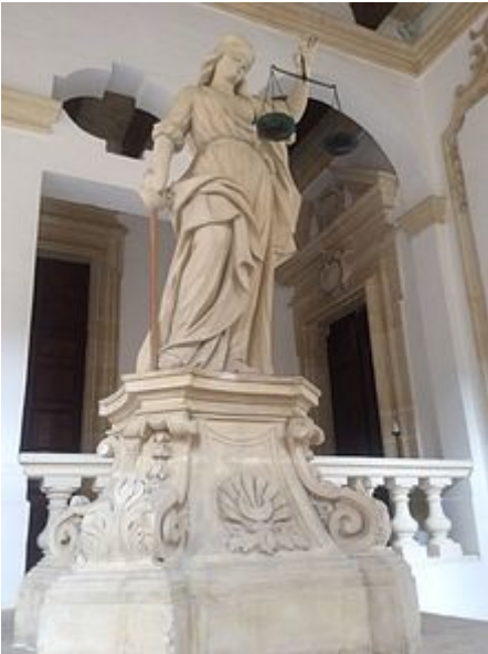
18th-century Lady Justice at the Castellania