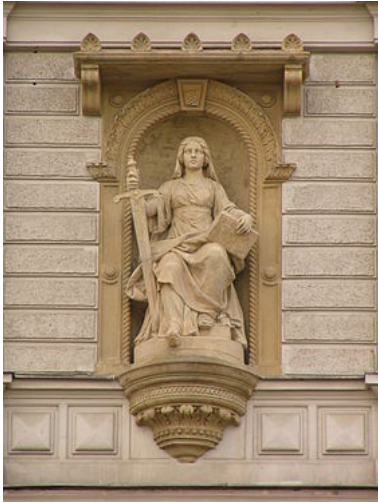
19th-century sculpture of the Power of Law at Olomouc, Czech Republic —lacks the blindfold and scales of Justice, replacing the latter with a book