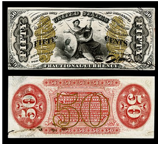
Justice holding scales, $0.50 U.S. fractional currency.