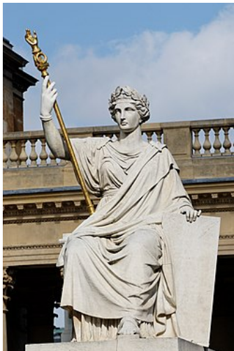
The Law , by Jean Feuchère