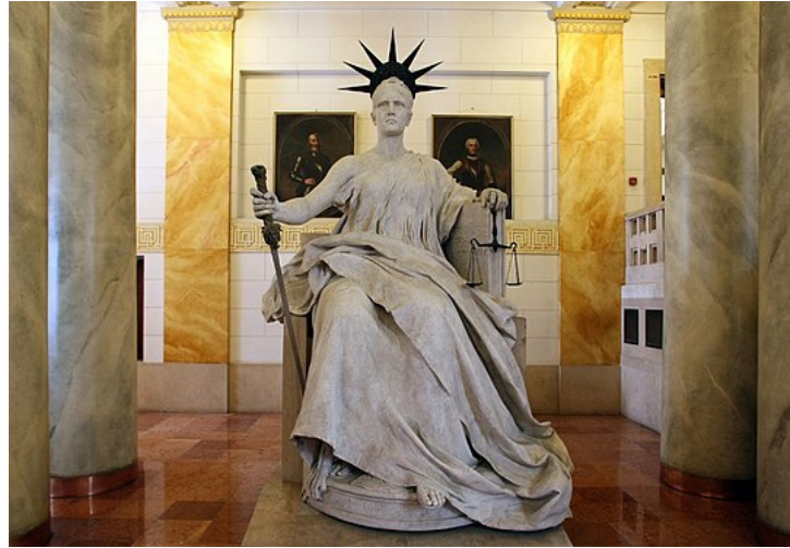
Justice by Diana Moore , Government Center , Newark, New Jersey Justitia in the Superior Courts Building in Budapest, Hungary . [12]