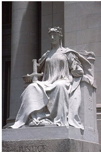
Shelby County Courthouse, Memphis, United States