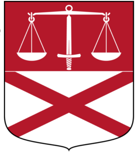
Scales balanced on a sword in the arms of Hörby