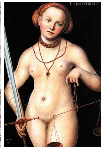
Gerechtigkeit , Lucas Cranach the Elder, 1537