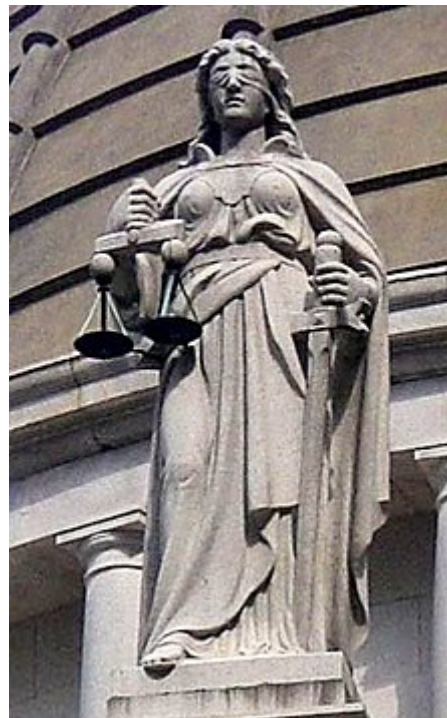
Justitia blindfolded and holding a balance and a sword. Court of Final Appeal , Hong Kong

Lady Justice originates from the personification of Justice in Ancient Roman art known as Iustitia or Justitia , [3] who is equivalent to the Greek goddess Dike .