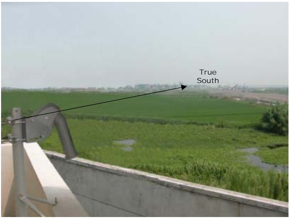
DMS International - http://www.dmsiusa.com