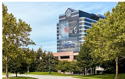
The Chrysler World Headquarters and Technology Center in Auburn Hills, Michigan, headquarters of Stellantis North America