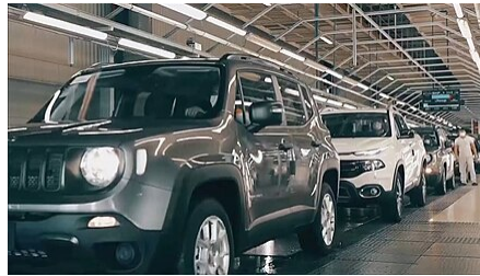
Assembly line in the Goiana, Pernambuco plant, Brazil