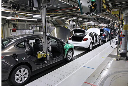
Assembly line in Gliwice